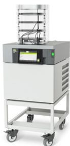
Lyovapor™ L-200 The first Freeze Dryer with Infinite-Control™