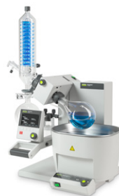
Rotavapor® R-300 Convenient and efficient rotary evaporation