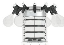
Acrylic chamber with 12 manifold top and shelves for bulk, vial and flask drying