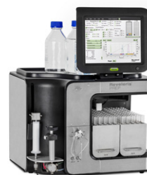
Reveleris® PREP A high-performance system with integrated flash and preparative HPLC in a single compact system