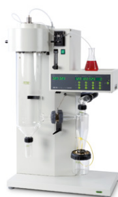
Mini Spray Dryer B-290 World leading laboratory Spray Dryer